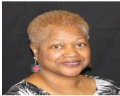
From the Corresponding Secretary

AS A REMINDER - Only NPA members may participate in NPA sanctioned tournaments; and must be a member thirty (30) days prior to the tournament date. The deadline to submit new member dues to play in Jacksonville is April 27 th .