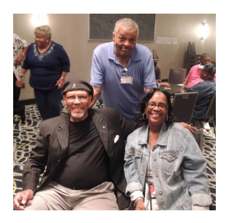
Title Town USA Pinochle Club